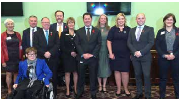
World AIDS Day Breakfast at parliament house

The SAMESH team was invited, along with other organisations working with people living with HIV, to attend a breakfast at Parliament House on World AIDS Day, December 1. There, it was officially announced that the South Australian government was committed to delivering a PrEP (Pre-Exposure Prophylaxis) trial in the state. This is welcome news for the community who have been advocating for a South Australian PrEP trial for some time. So far, no details on when or how the trial will be delivered have been released. To stay up-to-date on the PrEP trial, follow SAMESH on Facebook: www.facebook.com/samesh.org.au/