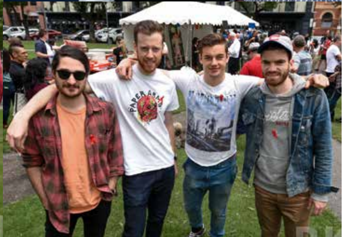
World AIDS Day BBQ 2017